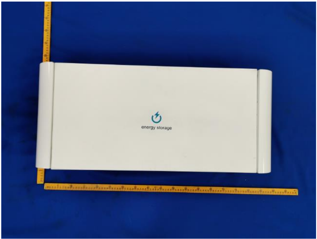
样品图片 (Sample photograph) -2