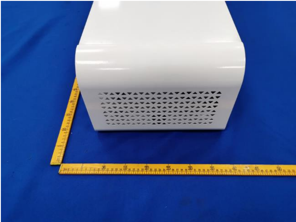
样品图片 (Sample photograph) -6